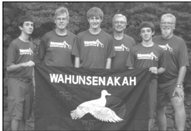
Arrowmen from the Wahunsenakah Lodge of the Colonial Virginia Council, Newport News, VA.

Come find our table in the Rhododendron Dining Hall and talk about lodge dance team experiences, difficulties, solutions, and questions.