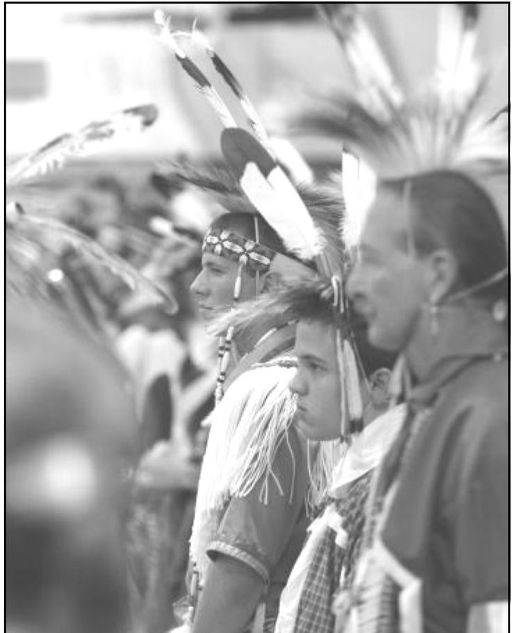
Arrowmen watch at the PowWow as others dance.

Drums were a critical part of the PowWow, brought by lodges from such states as California, Illinois, and North Carolina. The singing and beating of the drums could