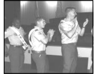
National officers dance at Tuesday's show.