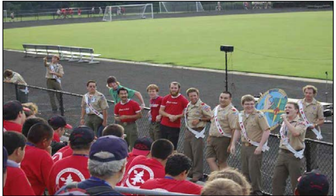
WESTERN REGION SECTION CHIEFS ADDRESSING LODGE CONTINGENTS DURING THE REGION GATHERINGS AT THE 2009 NOAC HELD AT INDIANA UNIVERSITY.

Participants MUST download this mp3 file and play it at the instruction of the region chiefs. The final meeting spot will be the Grand HoDag at Munn Field. For reference, please see an example at www.youtube.com/watch?v=lrCnh9sT_mc