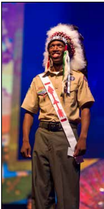
PRESTON IN THE OPENING SHOW