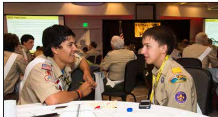
NATIONAL CHIEF JOHN REHM AND AN ARROWMAN TALK AT THE NCOC.

One phrase that was emphasized was "tools, not rules." Each lodge was given a multitude of materials to distribute, including the new Chapter Operations Guide, new videos, the new strategic plan, new Order of the Arrow High Adventure promotions ma-